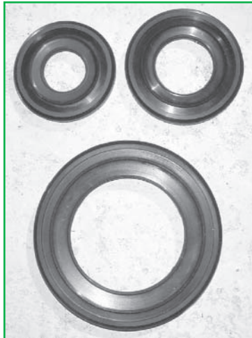
X-CEL™ 9091 CONNECTOR