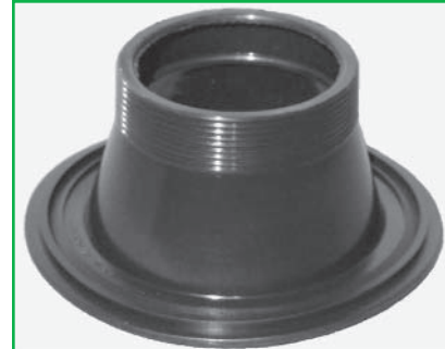
Z-LOK™ C104-4 CONNECTOR

CAST IN CONNECTOR CLAMPED DOWN ON PIPE TO CREATE WATERTIGHT CONNECTION