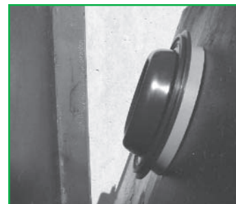
CONNECTOR ROLLED BACK ON MANDREL ATTACHED TO FORM